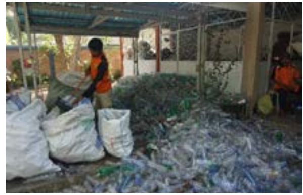
Figure 5. Processing Activities of Plastic Waste at Tapin Main Waste Bank

There were two types of waste reduction infrastructure in this area, waste banks, and the TPS3R. Based on the results of field observation, there were three waste banks and one TPS3R spread across several areas in North Tapin District. From the aforementioned infrastructures, some waste banks