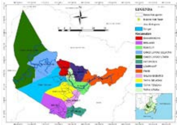
Figure 1. Map of The Administrative Boundary of The Study Locations