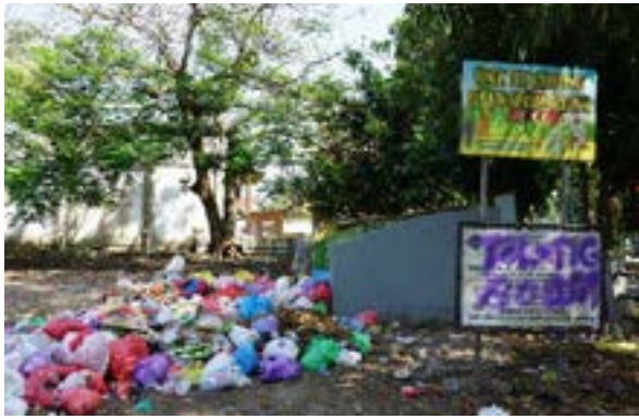
Figure 4. Pile up of Household Waste in Urban Area TPS

waste still accumulates during the day in the Terminal By-Pass area.